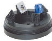
Headshell container 4