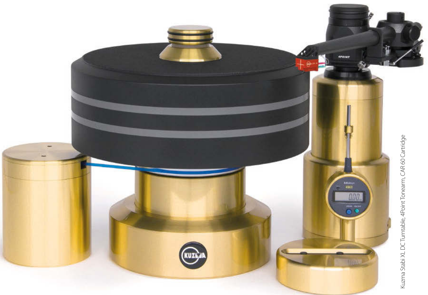
Kuzma Stabi XL DC Turntable, 4Point Tonearm, CAR 60 Cartridge