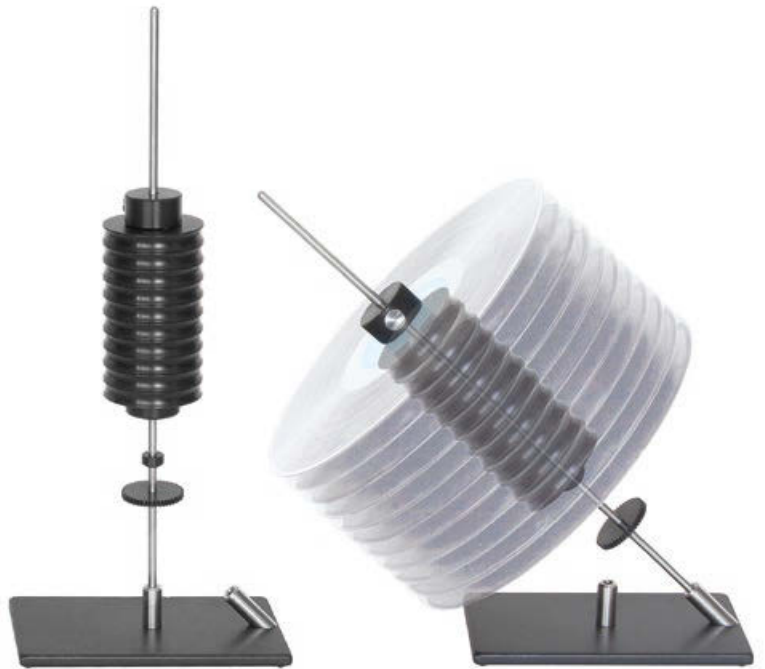
RD Ultrasonic kit

RD kit will allow you to submerge records in the ultrasonic cleaning bath and position them in a suitable drying position.