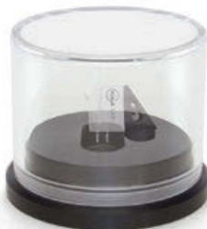
Headshell container single